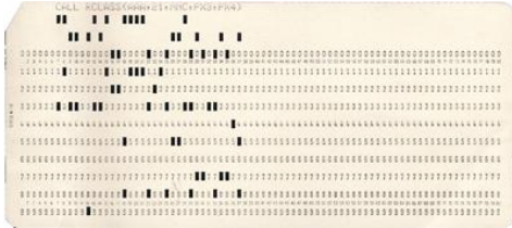
Hollerith punch or keypunch card