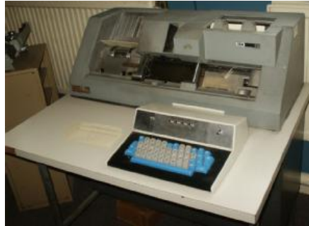
IBM 029 keypunch machine